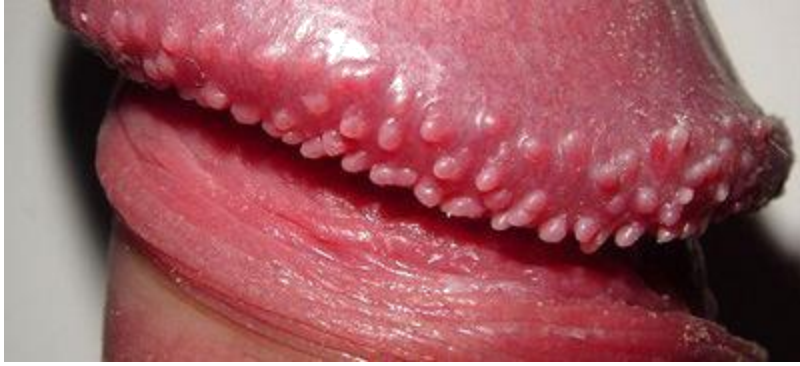
Pearly Penile Papules