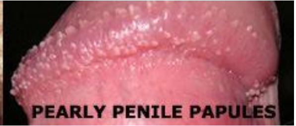
PEARLY PENILE PAPULES