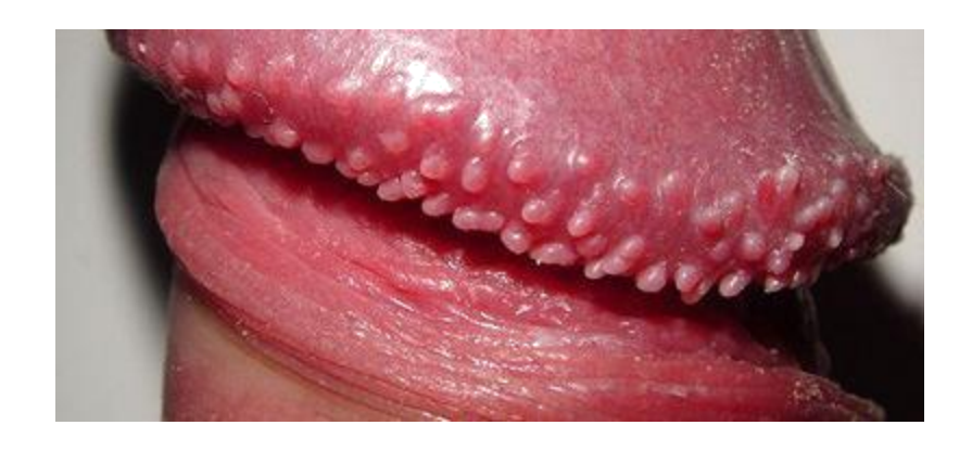
Pearly Penile Papules